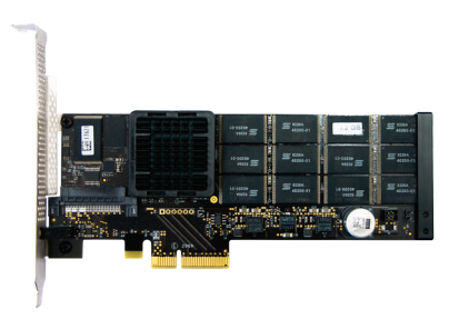
HP IO Accelerator